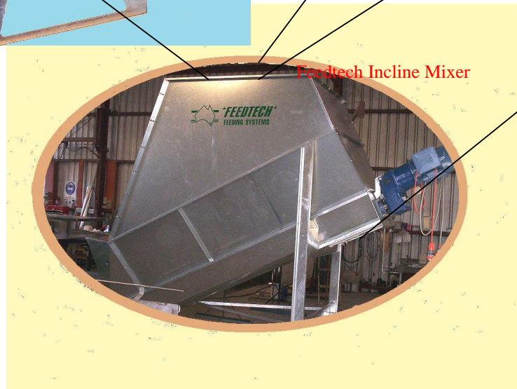
Feedtech Incline Mixer